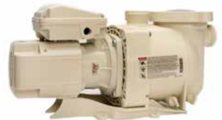
SuperFlo High Performance Pump