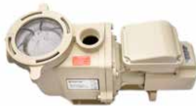
WhisperFlo High Performance Pump